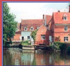
FLATFORD MILL, DEDHAM